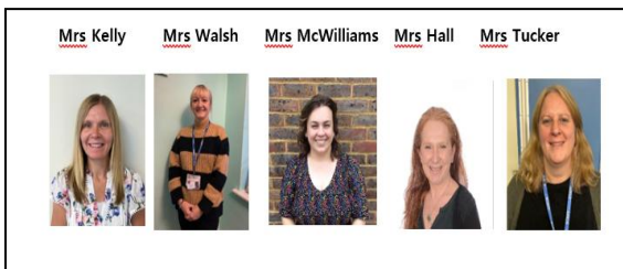
Our school Designated Safeguarding Leads