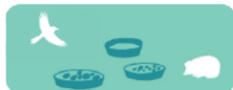
Food for wildlife