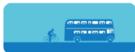
Walk, cycle, take the bus