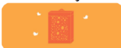
Homes for wildlife