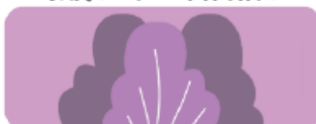
Plant a hedgerow