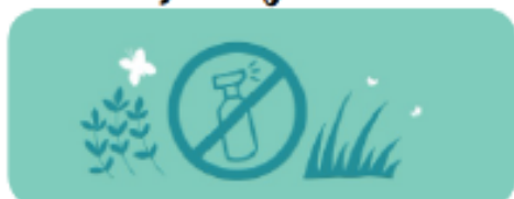
Chemical free gardening