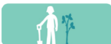
Plant a tree