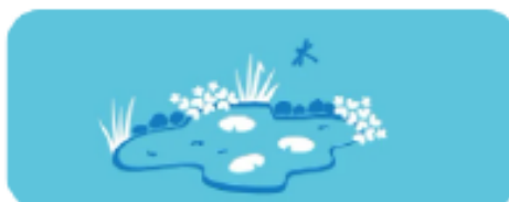
Water for wildlife