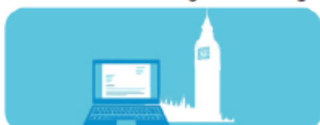
Use your voice