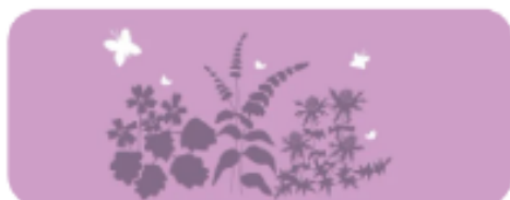
Leave your garden wild

Could you take an action to support our wildlife?